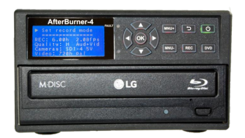
AfterBurner-4 with optical drive

Networking has been enhanced to allow for remote control and live monitoring via its Ethernet and WiFi* interfaces. The unit has an easy to use web-page interface for control and setup, along with the ability to live stream in RTSP format to video management systems such as Genetec and Milestone. Ovation Systems also provide free server software to make the connection to remote devices from an unknown IP address quick and secure.