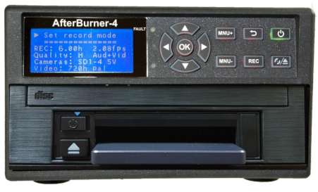
AfterBurner-4 with removable drive